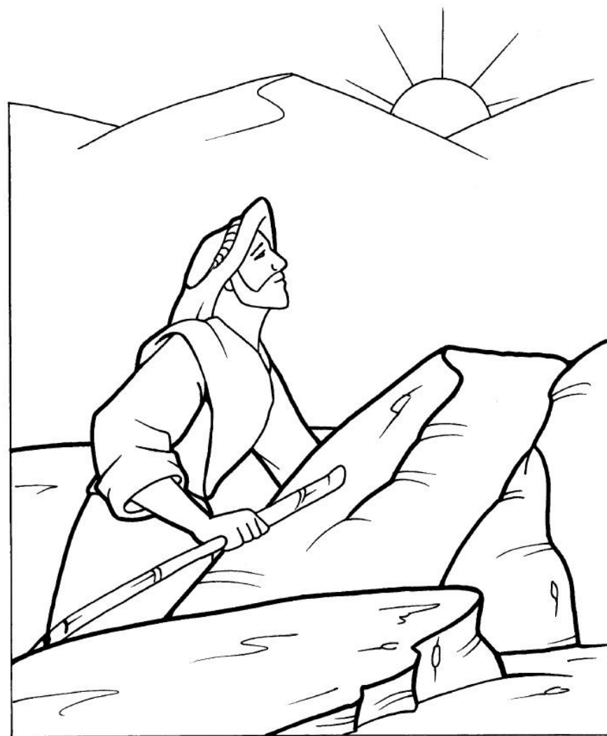
The Temptation of Jesus