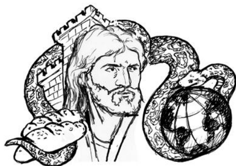
The Temptation of Jesus