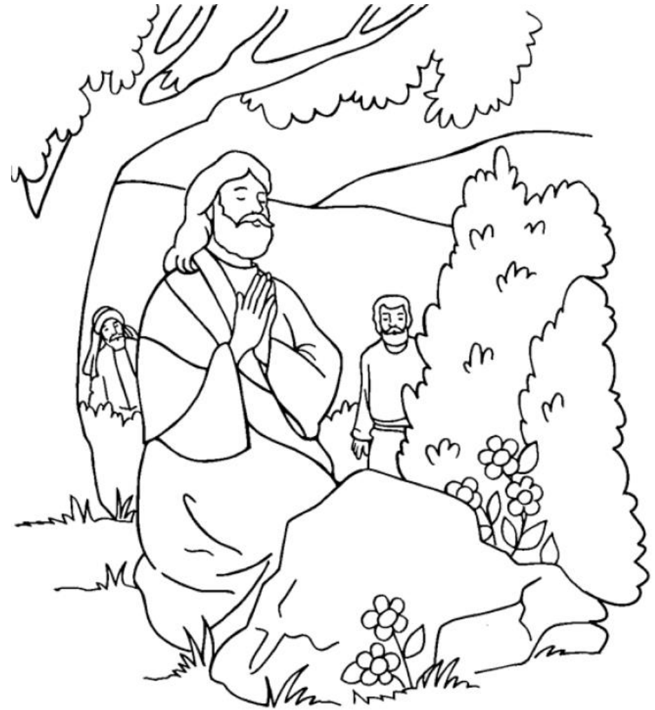
Jesus Prays in a Solitary Place

From Thru-the-Bible Coloring Pages © 1986, 1988 Standard Publishing. Used by permission. Reproducible Coloring Books may be purchased from Standard Publishing, www.standardpub.com , 1-800-543-1301.