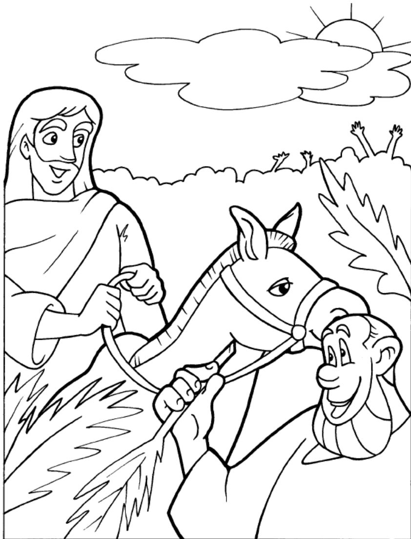
The Triumphal Entry